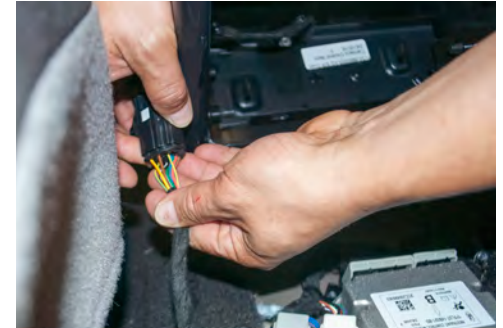
Lean seat back and disconnect wire harness on P/S. Set seat aside.