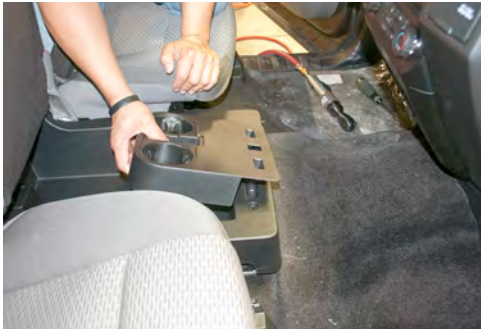
Lift up center console and remove OEM cup holder and set aside.