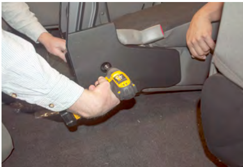
Remove rear bracket from OEM sea, held in place by (3) 1/2" bolts. Reinstall OEM bracket back into vehicle re-using (2) OEM 18mm bolts, that were removed 3 steps earlier.