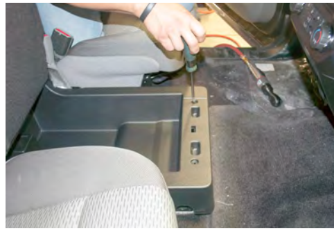
Remove the (2) T20 screws that were exposed.