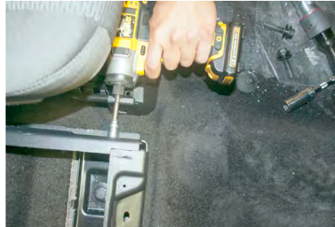
Remove (2) 1/2" bolts from the front sides of seat.