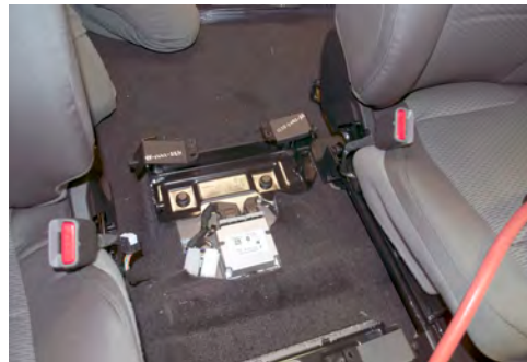
Loosely mount Floor Plate Feet, as marked on feet for location, onto sides of OEM brackets re-using (4) OEM 1/2" bolts.