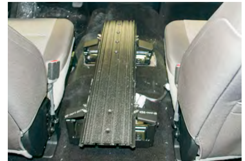
Slide Floor Plate onto brackets and into position using provided hardware. Once into desired position secure all hardware.

If you have questions or need further assistance please call Technical Support: 1.877.455.6886