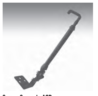
Screen Support - ACD

The Brace Kit attaches to the stand providing additional support. It can be adjusted in length and mounts to flat, vertical or angled surfaces.