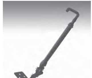
Screen Support - ACD

The Brace Kit attaches to the stand providing additional support. It can be adjusted in length and mounts to flat, vertical or angled surfaces.