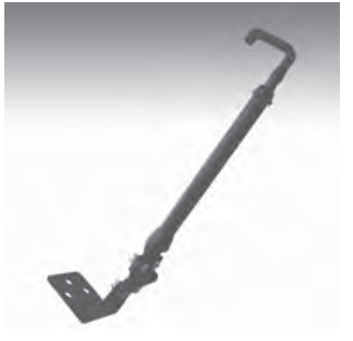
Screen Support - ACD

The Brace Kit attaches to the stand providing additional support. It can be adjusted in length and mounts to flat, vertical or angled surfaces.