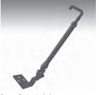
Screen Support - Acd

The Brace Kit attaches to the stand providing additional support. It can be adjusted in length and mounts to flat, vertical or angled surfaces.