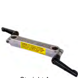
Straight Arm 425-3062