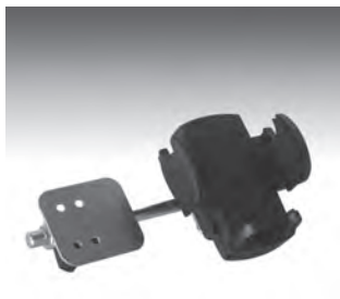
Pivoting Cell Phone Holder

Specifications subject to change without notice.