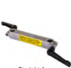
Straight Arm 425-3062