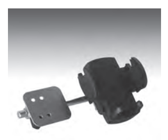
Pivoting Cell Phone Holder

Specifications subject to change without notice.