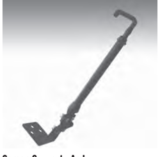
Screen Support - Acd

The Brace Kit attaches to the stand providing additional support. It can be adjusted in length and mounts to flat, vertical or angled surfaces.