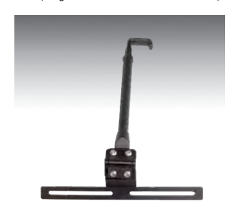
Screen Support - A-MOD

Computer securing system uses Kensington locking system. Fasten security cable to permanent structure in vehicle