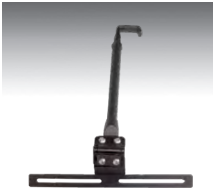
Screen Support - A-Mod

Computer securing system uses Kensington locking system. Fasten security cable to permanent structure in vehicle.