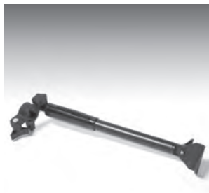
Brace Kit 425-5238

The Screen Support is designed to keep your screen in place while you use your computer. It attaches directly to the A-MOD Desktop and adjusts in height and tilt angle.