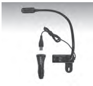
USB Light 425-2490

Allows you to tilt your phone independent of the desktop angle. Mounts to side of 10" x 12" Desktop.