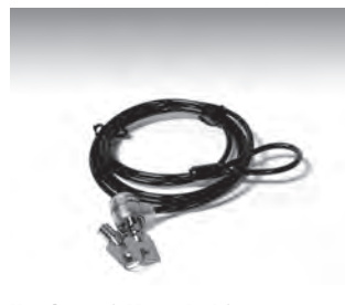
Kensington® Masterlock® 425-1317

12" flexible wand with blue LED's and rheostat to adjust brightness. Three foot power cord plugs into cigarette lighter.