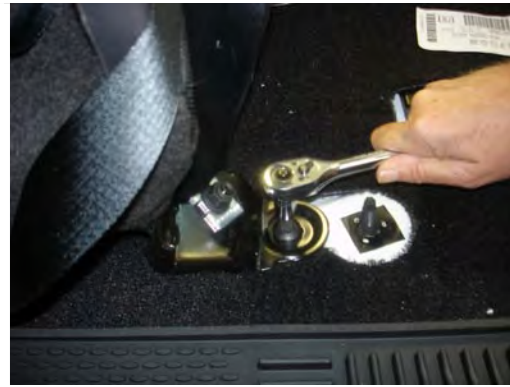
Remove the center console bolt using a T55 Hex Head.