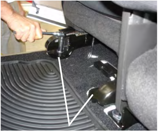
Remove the 2 covers and the two bolts form the rear of the driver side seat. Remove driver seat.