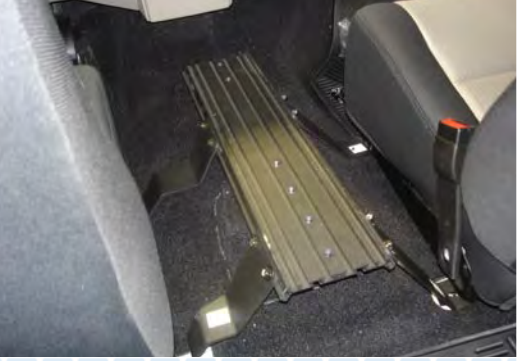
Replace the driver and passenger seats and tighten the bolts reinstalling the seats to secure the floorplate.