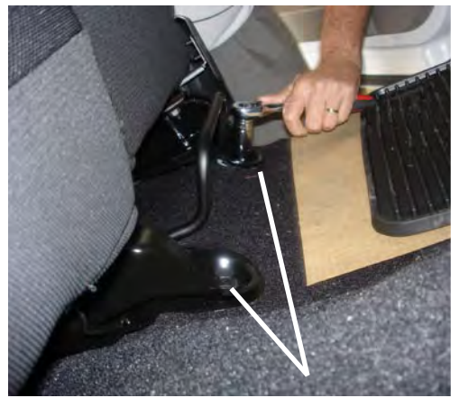
Remove the 2 front seat bolts from the driver side seat.