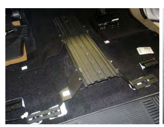
Place the bolts into slots on floorplate now align feet with seat bolts and align bolts to holes on feet and tighten nuts.