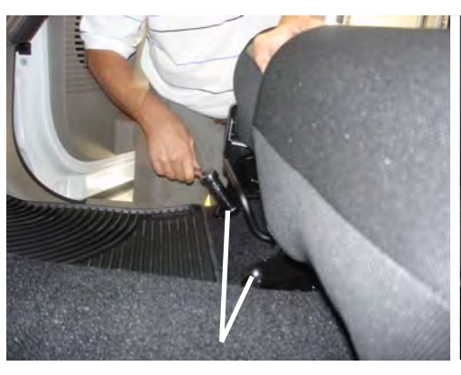
Remove the 2 front seat bolts from the passenger side seat.