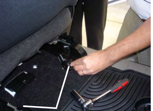
Remove the 2 covers and the two bolts from the rear of the passenger side seat. Remove passenger seat.