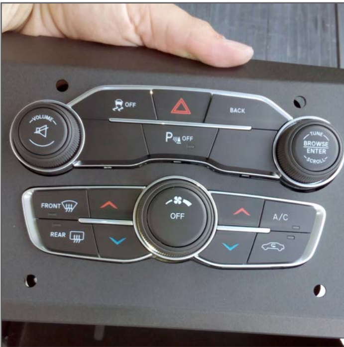
7. Slide module into provided cutout by aligning holes with studs on the backside of the console. Install provided nylock nuts to hold module into place.