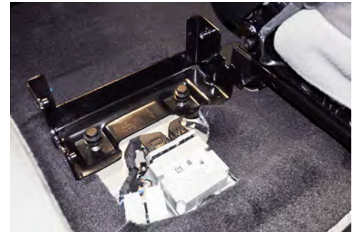
Remove (2) OEM mounting brackets.

If installing in a Police Responder: Remove OEM mounting brackets on floor board (see picture below) and proceed with install.