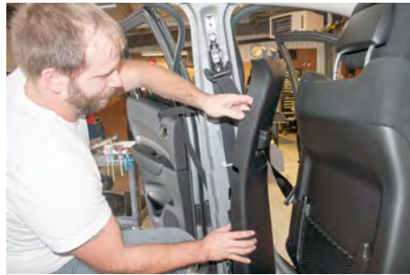
Using 9/32 socket remove exposed screw from Upper B pillar trim. Remove Upper B pillar trim.