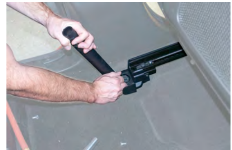
Place Foot Mount Bracket onto seat rail. Replace OEM bolt at this time. Snap cover back onto seat rail. Repeat all previous steps for other side.