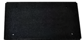
ABS Headliner Blank