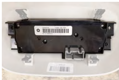
Detach the Rear AC Control Box from component housing. Then reconnect and position back into place.