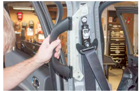
Use 10mm socket to remove both OEM bolts and grab handle.