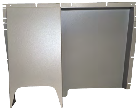
Bi-Directional Recessed Housing