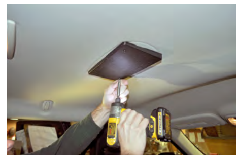
Install ABS Headliner Blank using the provided (4) black pan head screws.