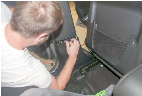
Pop plastic clips and remove lower B pillar.