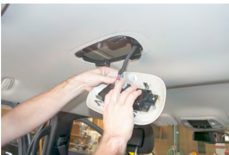
Remove and disconnect rear controls from headliner if vehicle has them.