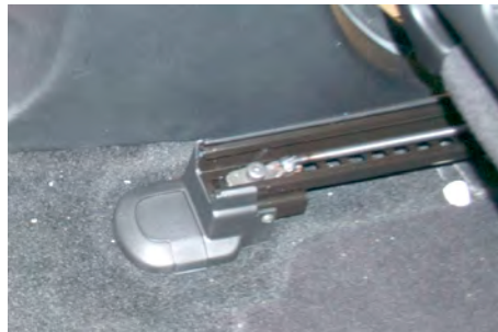
Move seats completely forward. Use a small flat head screw driver to pry cover off of seat bolt. Remove the rear/outer OEM 18mm seat bolt.