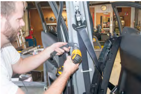
Use (1) 10mm OEM bolt to attach B Pillar Bracket to lower hole of grab handle. Reattach upper and lower B Pillar trim.