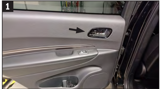
1. Remove the Latch Cover and Handle Cover to gain access to the OEM hardware. 10 mm Socket / Phillips required.