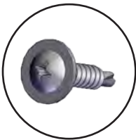
Phillips Head Tek Screws