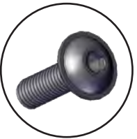
M6 Flat Head Cap Screw