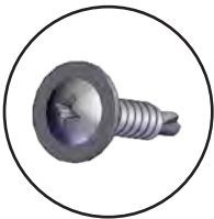
Phillips Head Tek Screws