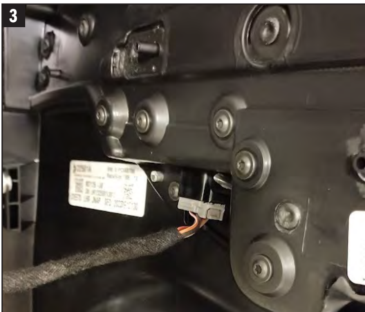
3. Unplug the window switch.