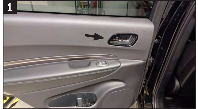
1. Remove the Latch Cover and Handle Cover to gain access to the OEM hardware. 10 mm Socket / Phillips required.