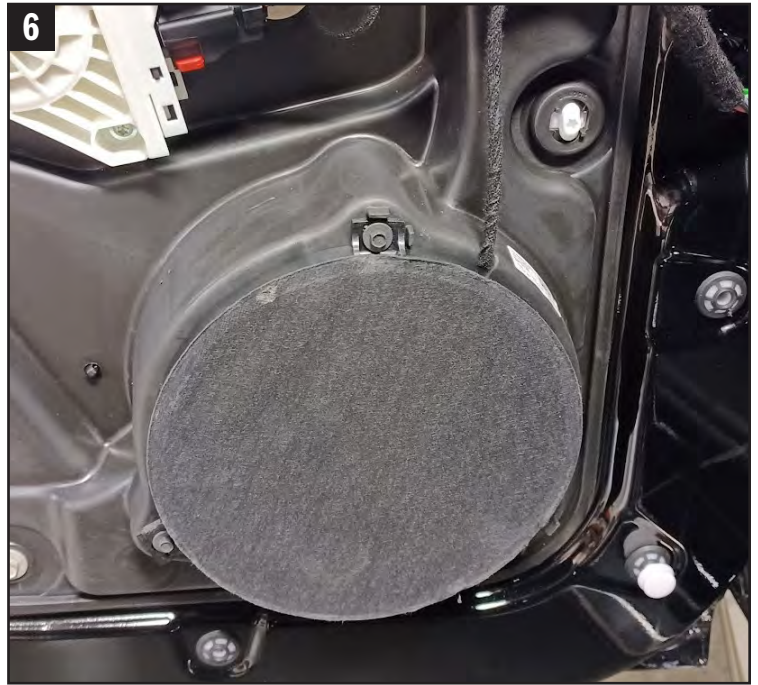
6. Remove the (3) speaker screws. 6 mm Socket. Speaker not reused.