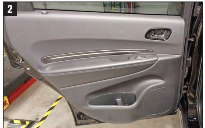
2. Using a trim removal tool, start from the bottom popping loose the Door Panel loose from the frame structure.