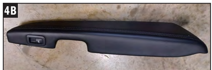
4. Remove the (16) screws from the back side of the door panel, removing the armrest section from the panel. Torx-15 Socket required.