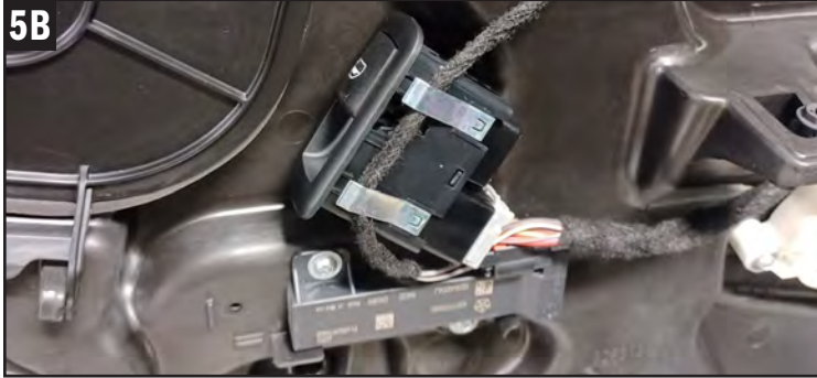
5. Squeeze the tabs while pressing it down to remove the window switch. Once removed secure and tape to the door frame.